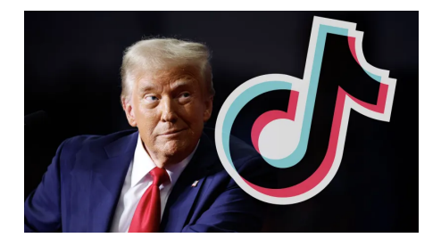
GOVERNMENT & POLICY

Trump asks Supreme Court to pause imminent TikTok ban