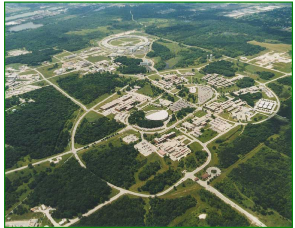
Argonne National Laboratory

Argonne has approximately 3,400 employees, including 1,100 scientists and engineers, three-quarters of whom hold doctoral degrees. Argonne's annual operating budget exceeds $750 million.