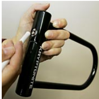
Word is spreading across the Internet: A ballpoint pen is all it takes to open this circular-key lock.

BOSTON — Bike lock maker Kryptonite struggled to reassure customers and protect its reputation on Friday following the disclosure that its famous U-lock can be foiled by a ballpoint pen.